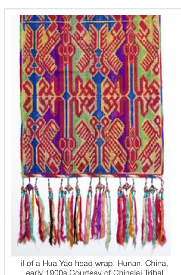
il of a Hua Yao head wrap, Hunan, China, early 1900s

Though they speak several dialects and follow a variety of traditions, Yao people maintain a unique cultural identity, which includes a rich oral history of song and legend. [i] Pan Gu, the original man, who out of chaos built the world, separating earth and sky, then expanded his body to form the universe. After his death his head became the mountains of the earth, his breath the wind and clouds, his limbs the four corners of the world, his blood the rivers, flesh soil, beard the constellations, skin and hair trees and herbs, teeth metal, bones and marrow rocks and precious stones, sweat raindrops, and the insects creeping through his body us... human beings.