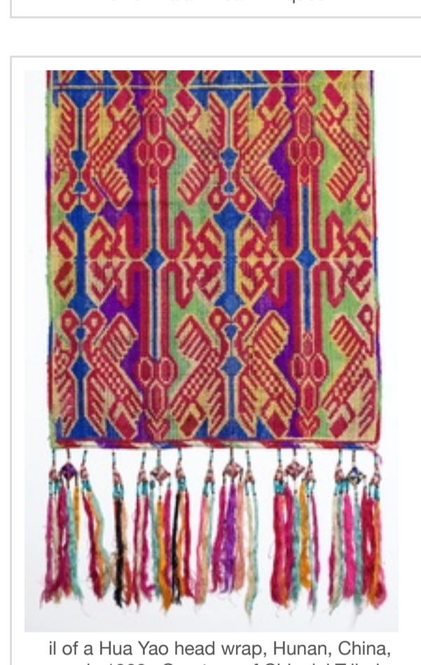
il of a Hua Yao head wrap, Hunan, China, early 1900s

Though they speak several dialects and follow a variety of traditions, Yao people maintain a unique cultural identity, which includes a rich oral history of song and legend. [i] Pan Gu, the original man, who out of chaos built the world, separating earth and sky, then expanded his body to form the universe. After his death his head became the mountains of the earth, his breath the wind and clouds, his limbs the four corners of the world, his blood the rivers, flesh soil, beard the constellations, skin and hair trees and herbs, teeth metal, bones and marrow rocks and precious stones, sweat raindrops, and the insects creeping through his body us... human beings.