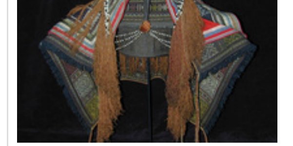
Yao woman's ceremonial hat set hat front closeup Guanxi early-mid 1900s

Also known as the Mien, Lan Tan, Mun, Pu Nun, Lu Ngien, Lak Kja, Zao and Dao according to clan and country, the Yao are descendants of people who lived in the mountains around the Changjiang River Basin in China during the Qin and Han dynasties (221 BCE to 220 AD). Today the majority of Yao people, with a population of over three million, are found throughout southwest China and mainland Southeast Asia.