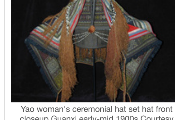
Yao woman's ceremonial hat set hat front closeup Guanxi early-mid 1900s

Also known as the Mien, Lan Tan, Mun, Pu Nun, Lu Ngien, Lak Kja, Zao and Dao according to clan and country, the Yao are descendants of people who lived in the mountains around the Changjiang River Basin in China during the Qin and Han dynasties (221 BCE to 220 AD). Today the majority of Yao people, with a population of over three million, are found throughout southwest China and mainland Southeast Asia.